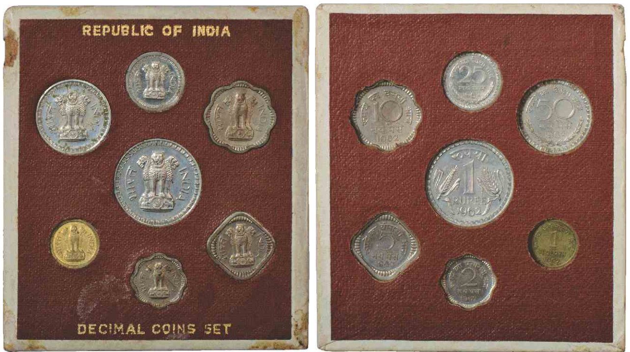
531. 1962, Proof set of 7 coins, Nickel and Copper, 1 Rupee, 50 Naya Paise, 25 Naya Paise, 10 Naya Paise, 5 Naya Paise, 2 Naya Paise and 1 Naya Paise, Bombay Mint , RB 5. In red card board. Sold for : ₹ .....