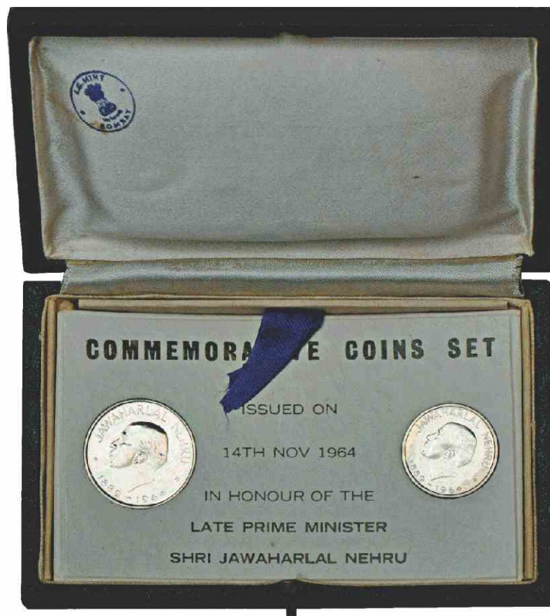
532. 1964, Jawaharlal Nehru , Proof set of 2 coins, 1 Rupee and 50 Paise (English), Bombay Mint , RB 8. In original black rexin box of issue. Sold for : ₹ .....